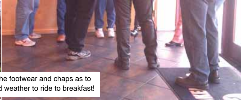
You can tell from the footwear and chaps as to who braved the cold weather to ride to breakfast!